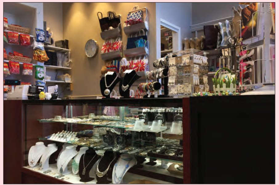
The CHH Gift shop offers a wide array of gifts. The shop helps the auxiliary in funding its projects.

Throughout the year, the auxiliary donated over $44,000 for the purchase of a blanket warmer for the continued care of the hospital's patients, five Vital Sign Digital Monitors, a specialized operating room scheduling whiteboard, molds for the podiatric surgeons to make antibiotic cement beads and computers and software for the CHH Sleep