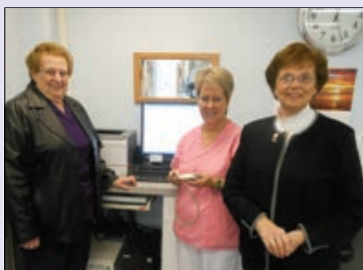
Winsted's Auxiliary donates $60K to fund new analyzing systems