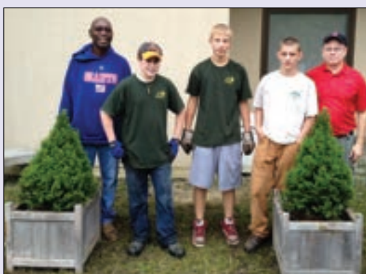
Torrington Boy Scout Troop 4 helps landscape CHH Emergency Department entrance area