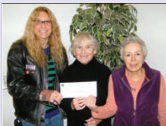
Free Spirit Lady Harley Riders donate $2,900 to local Cancer Fund