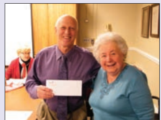
CHH Auxiliary donates the final $10,000 of their $50,000 pledge for information technology