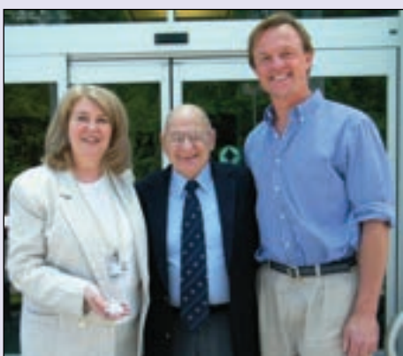
CHH Diabetes Center receives $1,000 from Harwinton Lions Club