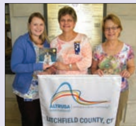
Altrusa Society donates 100 books to CHH Maternity Center