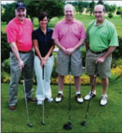
$88,000 was raised at the 10th Annual CHH Golf Classic to benefit the hospital's Pulmonary Rehabilitation Program.