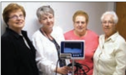
$90,000 was given by the Auxiliary for Community Health to help purchase new equipment for Charlotte's medical operations in Winsted.