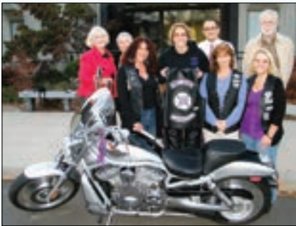
$4,500 was raised by Torrington based Free Spirit Lady Harley Riders Motorcycle Club to benefit the CHH Center for Cancer Care Fund, Inc.