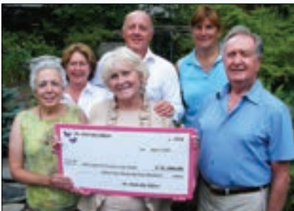
$31,400 was raised from the Annual Butterfly Event to benefit the CHH Center for Cancer Care Fund, Inc.